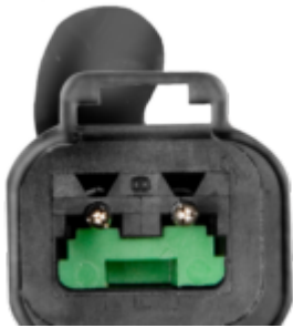
Pigtail Deutsch 2-pin